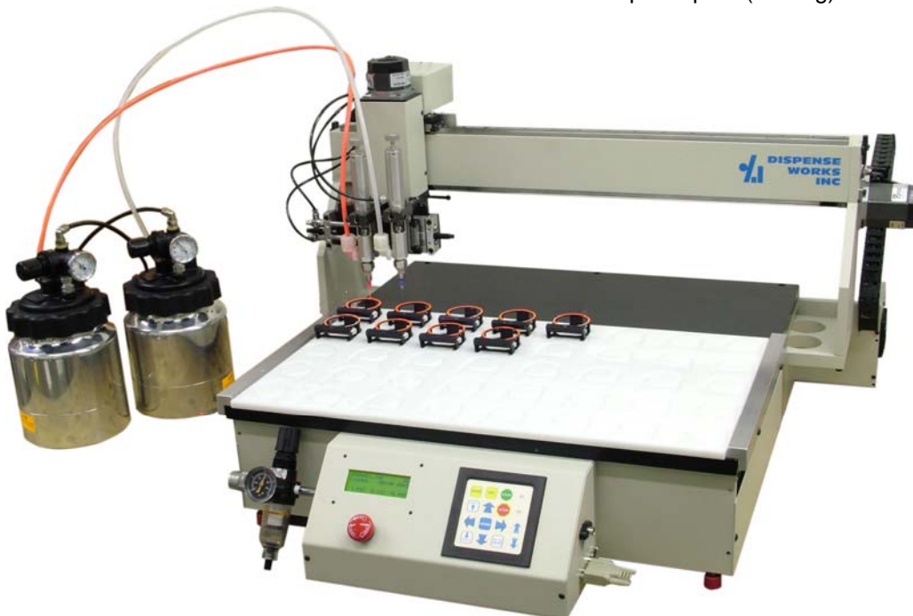
The Versatile RP-2415 Robot Features a 24" x 15" work area

Production is streamlined by allowing the operator to load / unload pallets during the machine cycle. With the included step & repeat (cloning) function, setup is a snap!