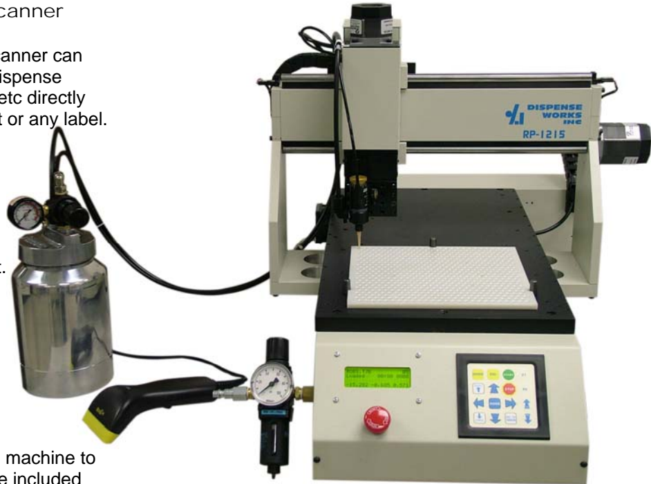
The Popular RP-1215 Robot

The scanner reads dozens of industry standard bar codes and is seamlessly integrated with the robot. It may be added in the field with no modifications required.