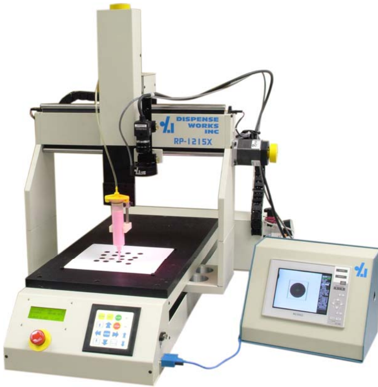
The Popular RP-1215 Robot