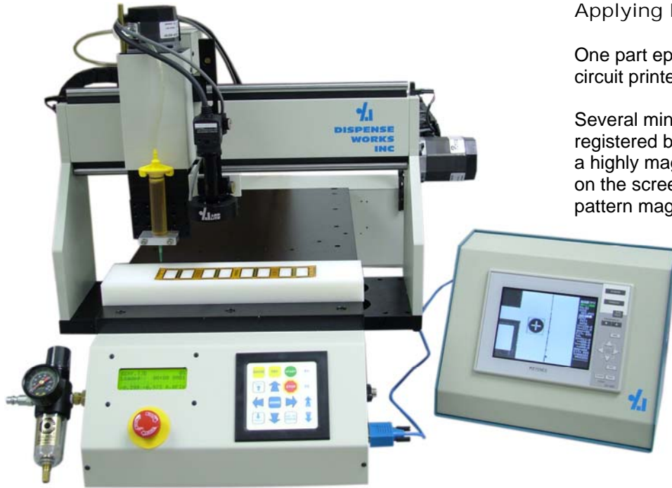
The Popular RP-1215 Robot